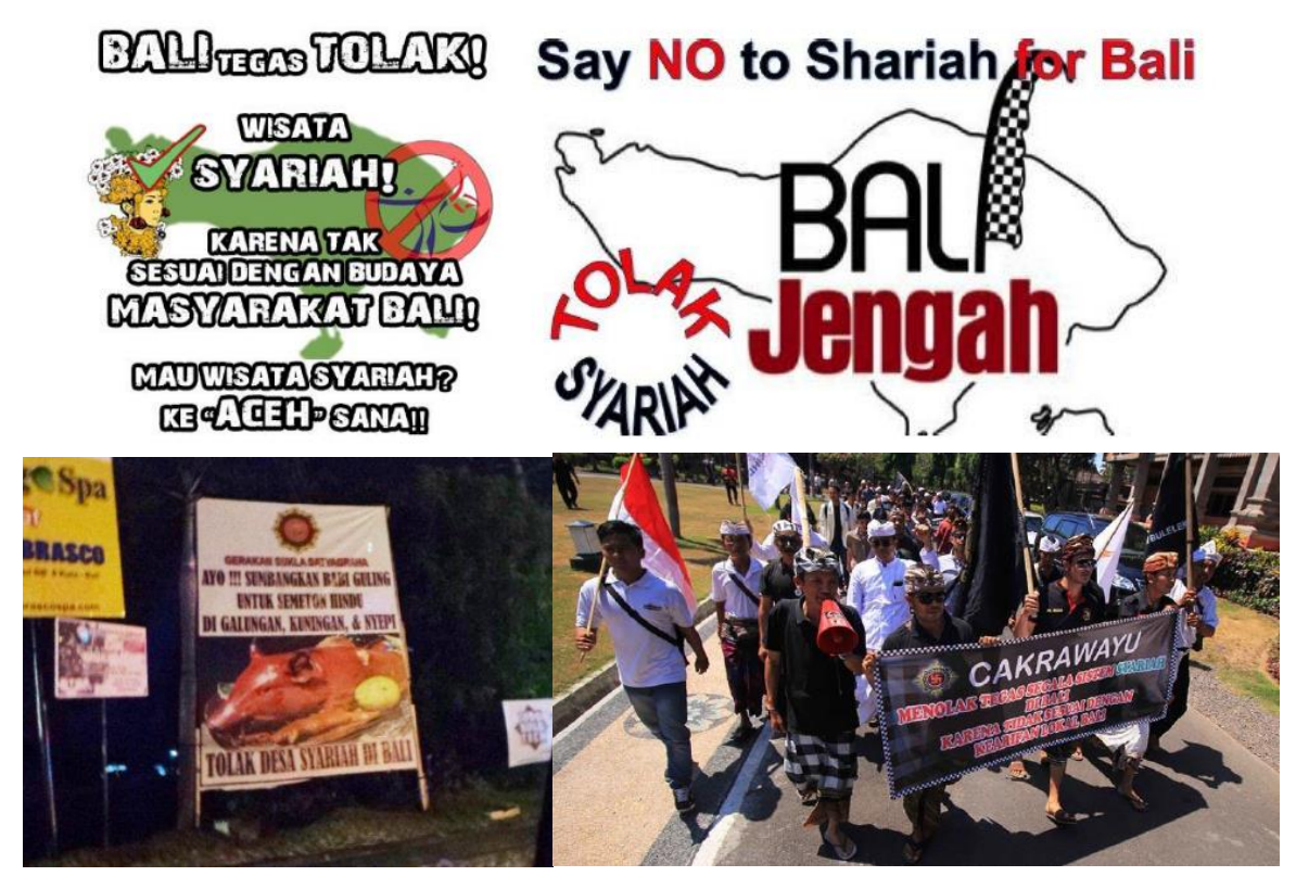
Figure 1. (top left) the picture about "Bali rejects sharia"; (top right) online petition; (bottom left) billboard; (bottom right) demonstration.

Not only from the publics, Bali tourism organizations, namely the Indonesian Tourism Industry Association (GIPI Bali) and Bali Tourism Board (BTB) also sent a letter to the Ministry of Tourism to reject the application of sharia in Bali travel. At last, this issue is finally settled well through deliberative consensus therefore it could handle with the disturbance in the community of Bali. Some ways to handle it include: