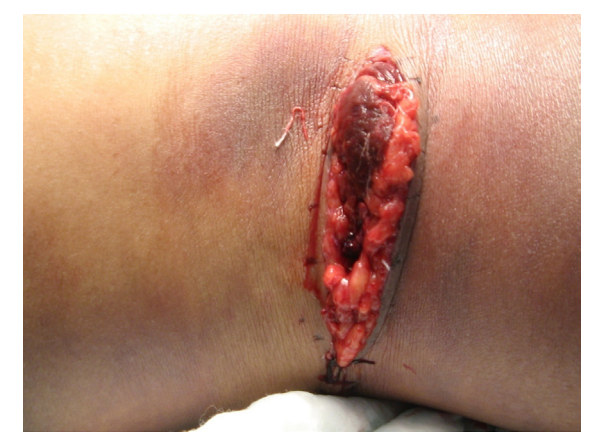
Figure 1. Laceration at the distal part of left popliteal fossa.

perform the fasciotomy (Figure 2). Twelve hours after medial and lateral fasciotomy, his left foot remained cold and the peripheral oxygen saturation also remained low. The pulse of the dorsalis pedis artery was absent. We diagnosed the patient with popliteal artery rupture. Fortytwo hours after the trauma, popliteal artery repair was performed using a great saphenous vein graft from the patient (Figure 3). There were no serious complications during and after the surgery. The perfusion of the distal part of his left foot was returned and the only sequel found was minimal ankle stiffness.