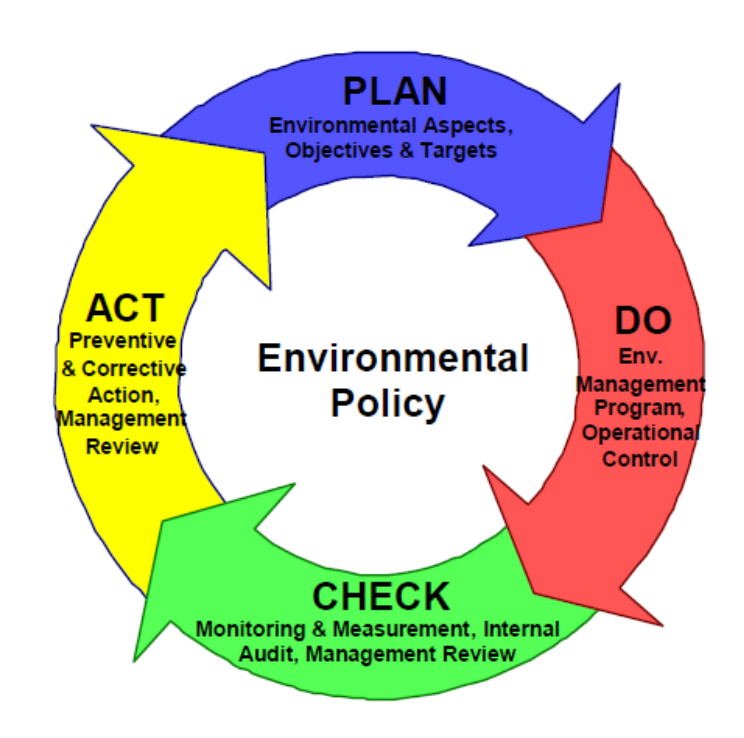
Figure 1. Samples of critical elements of ISO 14001 aligned with the PDCA system of enhancement

correspondence on the world applies to protocols for internal and external contact. The method consists of Interior coordination between various roles and levels of the organization and Acceptance, documentation, and answers to relevant external communications (ISO 14001) (Sari and Kamalia, 2019). Each institution may have a strategy for implementing environmental planning that varies according to their needs, so it is essential to conduct a thorough evaluation before making a strategy (Choi et al., 2017).