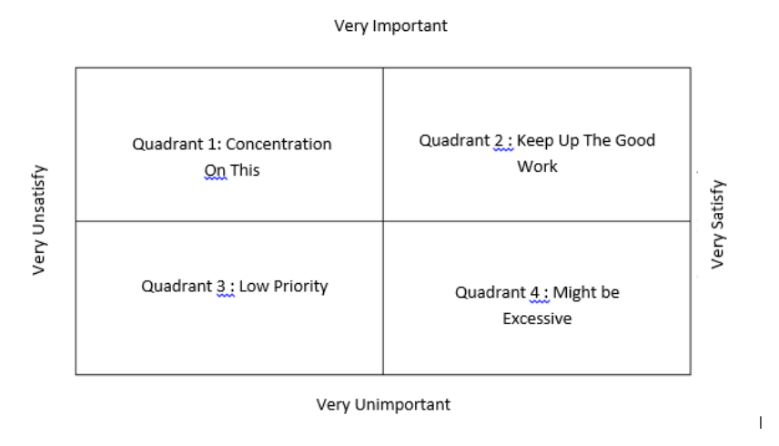
Figure 3. Importance Performance Analysis Diagram

Usually, the big challenge in implementing ISO 14001 in institutions is cost. In addition, the things that are crucial in its application are the awareness of all stakeholders (Gunawan et al., 2020). In terms of ISO 14001 implementation in university, AHP and IPA analysis are used to determine which factors are relevant to the implementation of ISO and needs to be improved. Conducting this analysis will help in the successful implementation process of ISO 14001 in university.