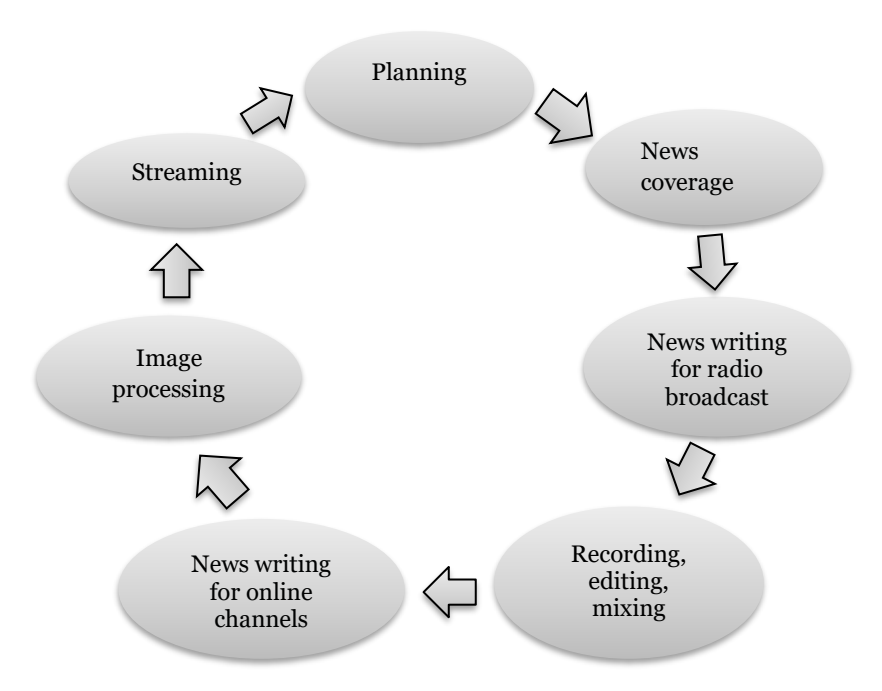
Figure 1. A convergent newsroom of private radio in Cirebon

issues. In reporting activities, reporters or scriptwriters will seek, collect, or select facts either directly in the field or sourced from other mass media. In the next step, the reporter or scriptwriter composes the script based on the information gathered and processed through recording, editing, and mixing for radio programs or writing and uploading on online channels. For online channels such as websites and social media, reporters or scriptwriters need to prepare and process images to complete the news. Lastly, the radio news that has been composed is also distributed to website channels and social media.