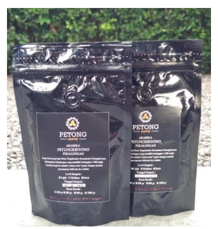
Figure 1. Example of Petong Coffe

Kopi Petong already has regular customers as well as foreign markets. Their difficulties regarding production materials should be overcome if they are able to invite coffee farmers in Petungkriono to jointly process coffee to be more valuable and not sell in raw conditions. This issue is still hampering because so far intensive communication from both the government and Pokdarwis has not been carried out to the full. Another product that can be superior is Ant Sugar. This product was pioneered by young people who were members of Pokdarwis. They saw that the potential of sugar owned by Petungkriono could be developed into higher-value ant sugar.