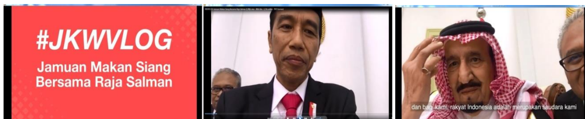
Figure 3. Vlog Presiden Joko Widodo lunch with King Salman