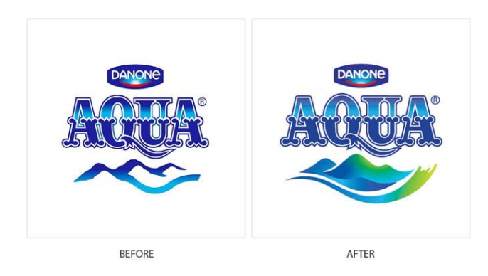
Figure 2. The transformation of AQUA's logo (Logo Baru Aqua - BiteBrands, 2013)

AQUA as the first bottled water industry in Indonesia has emotionally attached to Indonesian since years ago. To some people, drinking bottled water becomes the life style because it is practical. Talking about bottled water, Indonesian will always easily remember AQUA. The popularity of AQUA makes AQUA as the generic trend mark for bottled water industry in Indonesia. Indonesian especially young people will easily remember the logo of AQUA itself. AQUA has renewed its logo for several times as the rejuvenation of the face of AQUA itself. On year 2013, AQUA celebrated the 40th anniversary and renewed the logo. The purpose of renewing the logo is to raise enclosure with more AQUA's stakeholder.