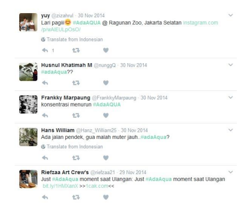
Figure 3. Audiences' Response on Twitter (#AdaAQUA, 2014)

Katz, Blumer, and Gurevicth (1974) stated that people as an audience is categorized active and the goal is its media use (as cited in West & Turner, 2010). Through social media account of AQUA which is Twitter, AQUA encouraged young people to share their awkward moment that occurred as a result of dehydration. Here, people as an active audience giving their participation in Ada AQUA Campaign. Surprisingly, AQUA got good responses from a lot of people especially young people on social media in Twitter. It is proved by the total hashtag of #AdaAQUA reached 450,000 mentions, which not only through Twitter, but also other social media. As Lineberry stated that the interactivity of new media users is higher than traditional media users, the new media here means Internet, blogs, and SNS (Lineberry, 2012). The target of hashtag #AdaAQUA was only 50,000 mentions, but it reached 450,000 as the evidence that this campaign got big attention from the society.