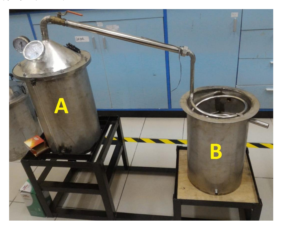
FIGURE 2. Pyrolysis Reactor

Question prepared in instrumental question type based on reactor that student used to learn (Figure 2). There are two basic part of reactor in pyrolysis which are burning furnace (symbol A) as biomass burning take place and condenser (symbol B) as part in which gas converted to liquid called bio-oil (side product of pyrolysis process).