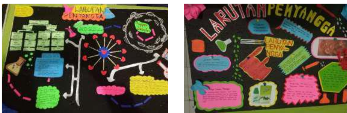
FIGURE 1. The results of the student project in the form of a wall magazine

Projects produced by students for buffer solution material in the form of wall magazines. Examples of madding produced by students are found in FIGURE 1 .