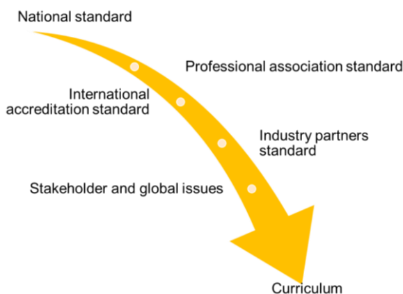
FIGURE 1. Standards need to accommodate in the curriculum.

The second is the professional standard; in this case, a professional association such as PII (Indonesian Engineer Association) might have a chemical engineering curriculum standard. This practice has been implemented in medical education [13]. International accreditation standard is from the Indonesian Accreditation Board of Engineering Education or other foreign accreditation board such as the Accreditation Board for Engineering and Technology, USA, or Institute of Chemical Engineer, the UK. Many universities are eager to receive international recognition, so they need to implement international standards such as the Washington accord. Industry partner standard, especially for the students under the agreement to work for industry partners after graduation. The curriculum needs to accommodate these all inputs. The suggestion and critics from stakeholders, including industry partners, alumni, professional associations, parents, public and global issues, are also an input for the curriculum (Figure 1).