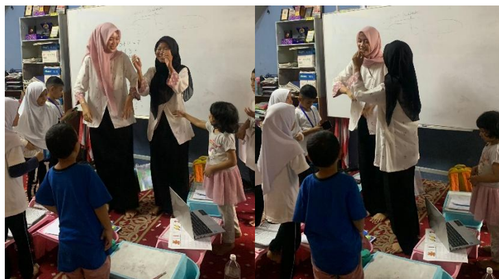
FIGURE 1. Learning Documentation

After students understand the basic calculation material, the singing method is applied as a learning-strengthening activity. Starting with introducing the notes and lyrics to the students, the teacher sang the song several times and invited the students to follow along so they could quickly memorize it. When students begin memorizing the song's notes and lyrics, the teacher teaches hand movements corresponding to the so-called numbers, which the students repeat. This method involves combining songs and hand movements that are adjusted to the numbers in the song lyrics. Each time the summation lyrics are sung, students are asked to indicate the number of numbers using finger or hand movements. This movement aims to be a concrete picture of the numbers being studied, so that students can relate number symbols, song lyrics, and numbers directly. Based on Figure 1, during the teaching-learning process, students look very excited, which can be seen from their active participation in various activities carried out.