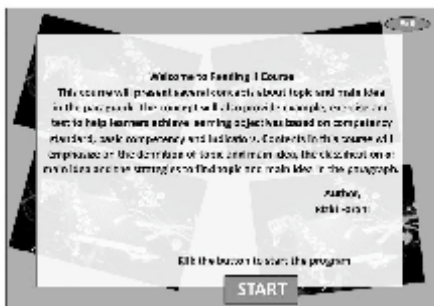
Figure 1: Welcome Page