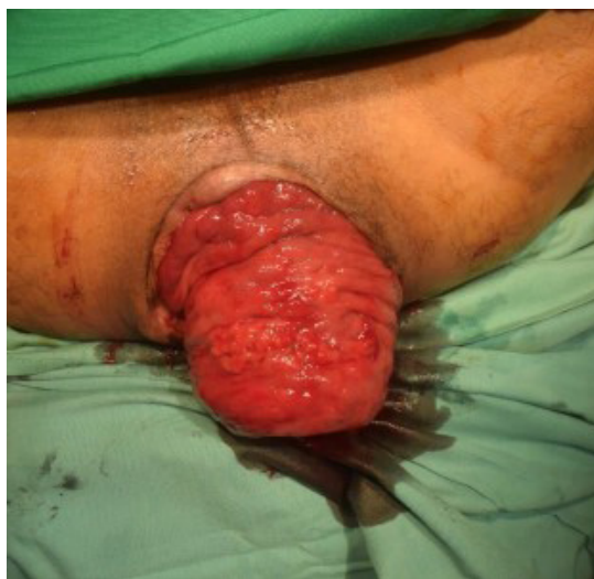
Figure 2. 12 cm long rectal prolapse

The 32-year-old male patient came with the chief complaint of a lump in the anus after having hemorrhoidectomy operation three times. The patient brought colonoscopy and colon in loop results, which were within reasonable limits. The trans-endoscopic biopsy result showed non-specific inflammation. The patient is a young and sexually active male, who is undergoing in-vitro fertilisation program. In the intra-operative physical exam, we found the length of prolapse was 12 cm (Fig. 2). Perineal rectosigmoidectomy (Altemeier procedure) was performed with intra-operative bleeding 300 ccs, and the duration was 2.5 hours. After the operation was done, the patient got two transfusions of whole-blood. The patient had a fever then, and laboratory