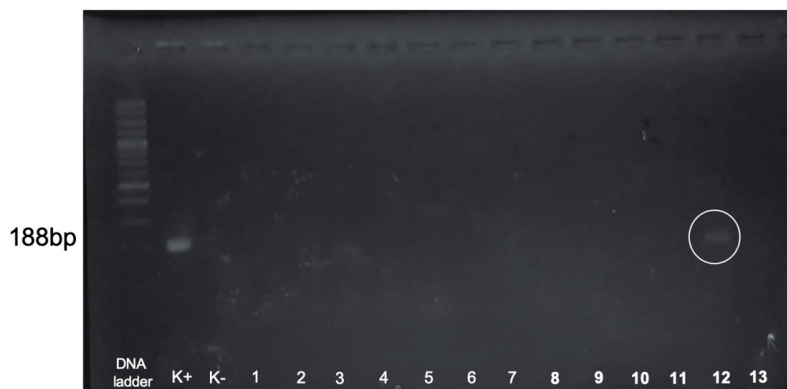
Figure 2. PCR amplification of the Ae. aegypti pool from Doro Pekalongan Regency, Central Java, Indonesia.

There was no larva of W. bancrofti on the microscopic dissecting mosquito of artificial infection at both day 8 th and 14 th . Likewise, the PCR examination results were negative at both stages of the examination.