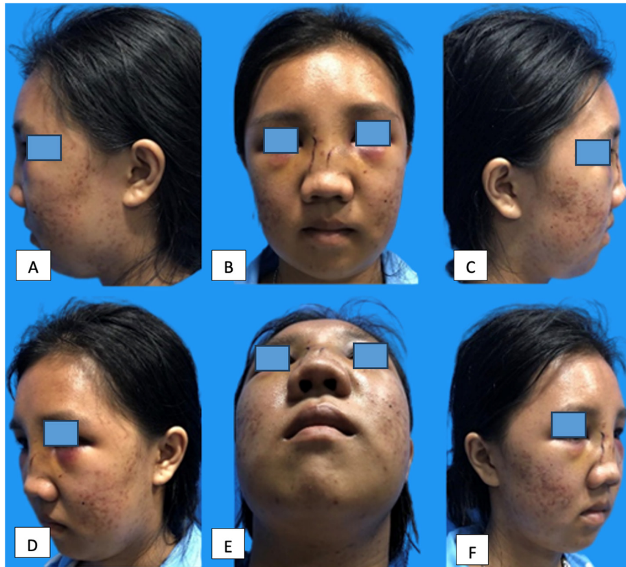
Figure 1. Post-accident picture of a patient