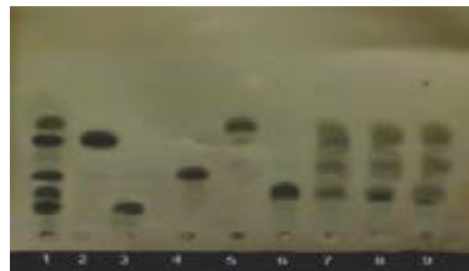
Figure 1. TLC profile Cilembu sweet potato extract and the standards. Figure explanation : (1) glucose, lactose, sucrose, fructose, galactose; (2) glucose; (3) lactose; (4) galactose; (5) fructose; (6) sucrose (7),(8) and (9) Cilembu potato extract 1; (8) Cilembu potato extract 2 and (9) Cilembu potato extract 3.

Qualitative analysis of Cilembu sweet potato extract was done using 4 means, which were Molish tube test, Benedict tube test, Barfoed tube test, and TLC. 14 The results of the tube tests can be seen in Table 1. The result of TLC could be seen in Figure 1.