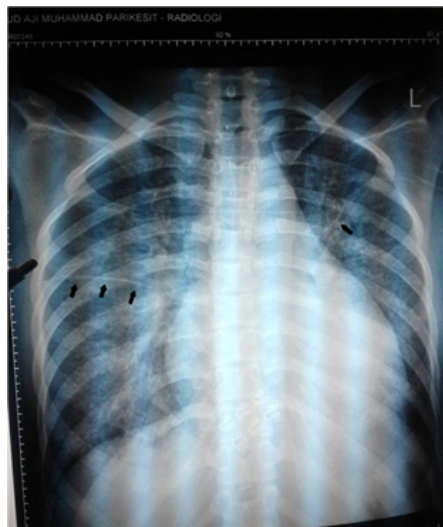
Figure 1. The patient's chest X-ray showed Kerley A line (black arrows), perihilar cephalization, and mild cardiomegaly. The line can be seen clearer in right lung than left lung.

intermittent, getting worse in mild activities. Then, the dyspnea became progressive so that the patient came to the emergency room. The patient did not complain a cough, wheezes, or febrile. Previous histories of asthma, allergy, or remarkable disease were denied, patient was completely healthy before. On physical exam, the patient was conscious, tachypneic, pale, and mild diaphoretic. Blood pressure was 150/90 mmHg (after taking rest about 30 minutes on the Emergency Room's bed); Heart Rate: 120 x/min; Respiration Rate : 28 x/min; T: 36,8oC; Saturation O 2 : 90% (improved to 98% on Non Rebreating Mask 10 lpm). The conjunctiva was anemic and anicteric. The thyroid was normal on inspection and palpation. There is no evidence elevated jugular venous pressure. The pulmonary exam showed no wheezing but there is a coarse rhonchi from middle to lower field bilateral.