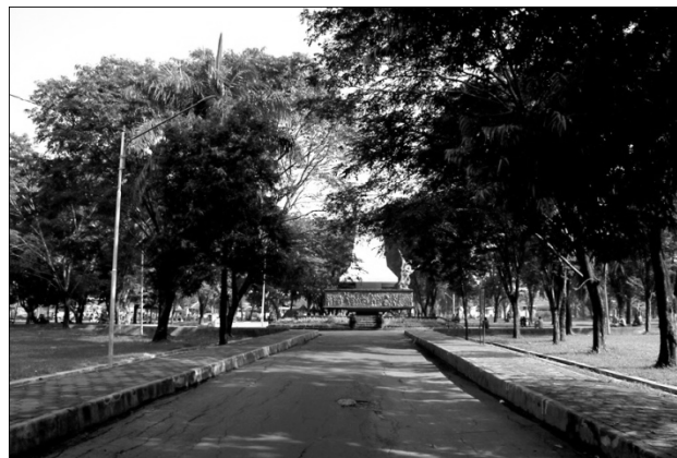
Figure 4. Monumen 45 Park at present, after the revitalization program