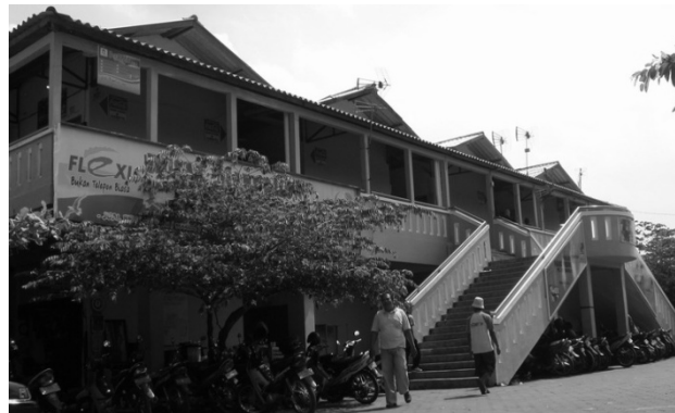
Figure 5. Pasar Klithikan Notoharjo, the market built to accommodate informal vendors post-relocation.