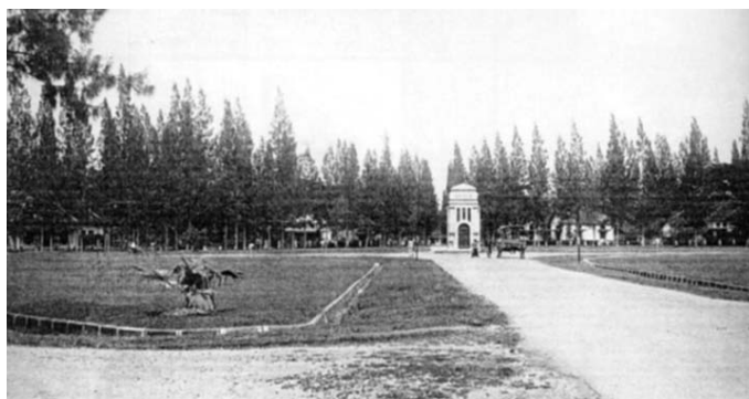
Figure 2. Villa Park, the initial park, circa 1900 (Bruggen and Wassing, 1998)

This park was once a field for battle training and horserace of the Mangkunegaran Aristocracy named Villa Park surrounded by residential neighborhood .