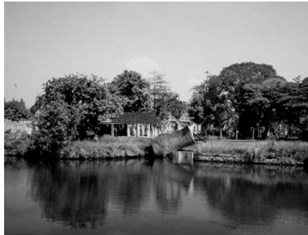
Figure 6. Balekambang Park (2005), before the revitalization program