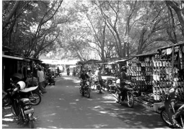
Figure 3. Monumen 45 Park (2005), before the revitalization program, crowded with informal vendors