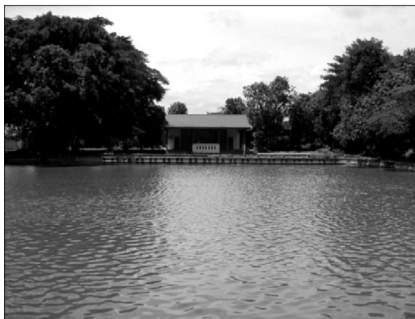
Figure 7. Balekambang Park at present after the revitalization program

area or town. This could be achieved through urban regeneration, which recovers historic buildings and urban areas from obsolescence as well as revitalizes their economic life.