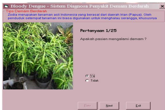
Figure 3. Screen Question 1