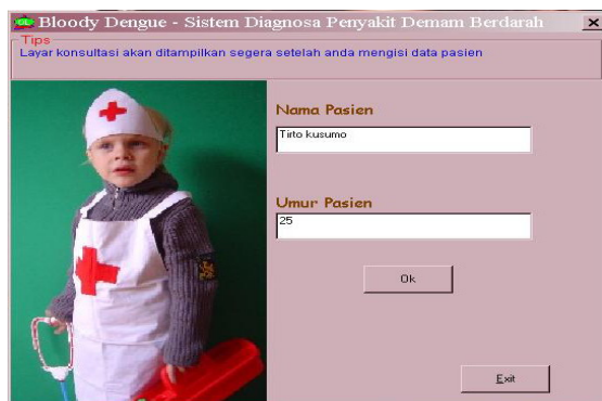
Figure 2. Screen Pasien Data