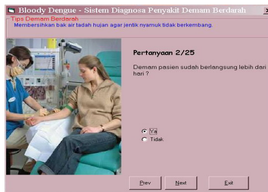
Figure 4. Screen Question 2