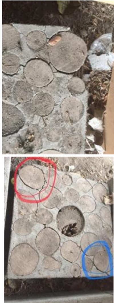
Figure 5. Condition of the top side of the floor block after 5 months

wood so that it shrinks. This condition makes the blocks less cohesive and fragile (Figure 5).