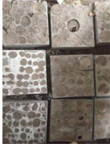
Figure 2. Installation of wooden concrete floor blocks after 5 months

the wood that has been eaten by termites. Termite damage begins at the bottom of the block in direct contact with the ground (Figure 3).