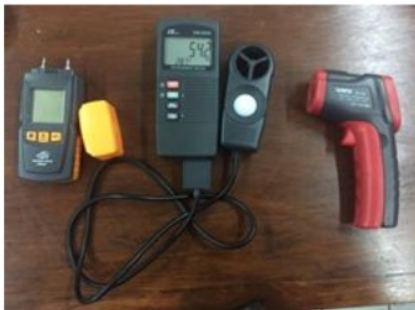
Figure 1. Infrared thermometer shafix WT380, Wood moisture tester GM605, dan Environment Meter EM-9000

The block floor covering of logs and concrete is measured in two test formulations; (1) The resistance of wood to subterranean termites; by looking at the comparison of the results of the experiment in several timeframes and assessing the quality of the upper and lower surfaces of the wooden-concrete floor blocks. (2) Changes in surface temperature and humidity; tested using 3 measuring instruments in the form; infrared thermometer shafix WT380, Wood moisture tester GM605, and Environment Meter EM-9000.