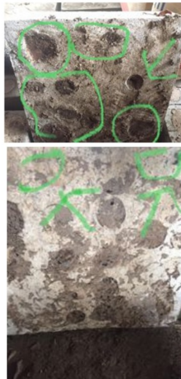
Figure 3. Condition of the bottom side of the floor block after 5 months