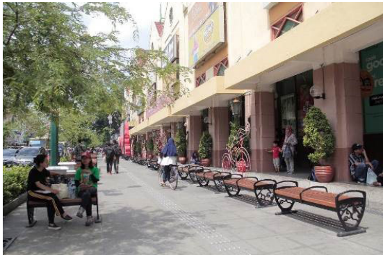
Figure 3. Street furniture in Malioboro.

The existence of Malioboro as a public space is in accordance with Illiyin and Idajati (2015) opinion, where this area can accommodate various community activities both individually and in groups, and can become a place for people to socialize, seek entertainment, and release fatigue with socio-cultural distinctiveness (Manurung, 2018) in Malioboro.