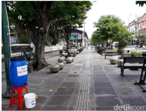
Foto: Malioboro sepi gegara pandemi Corona, Yogyakarta, Kamis (26/3/2020).