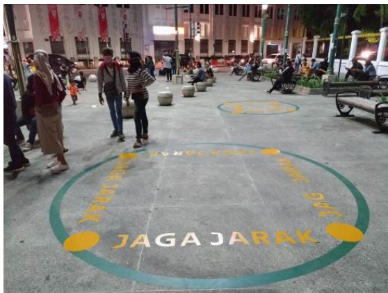
Figure 12. Officers who do not remind the public to keep their distance.