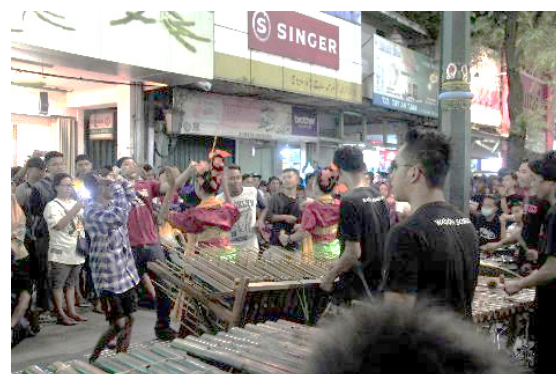
Figure 2. Night music attractions are one of the interesting activities in the Malioboro street area.

As a public space, Malioboro is inseparable from the architectural elements that form it, such as old buildings that are still standing and street furniture along Malioboro. This is evidenced by the questionnaire results, where 54.9% of respondents answered that architectural elements are the most interesting things in the Malioboro street area. The existence of street furniture elements, such