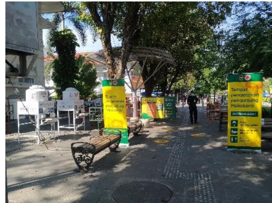
Figure 7. A health protocols information in the form of writing or graphics placed on the pedestrian path.