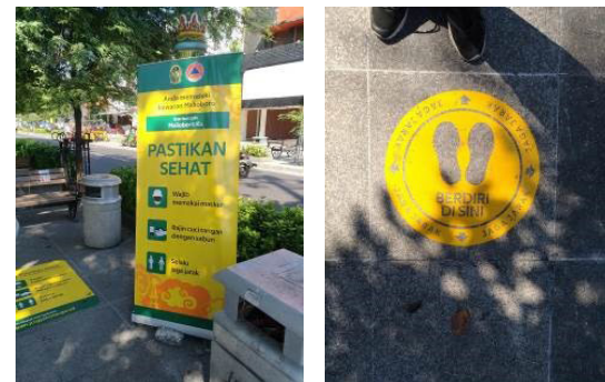
Figure 8. The call for distancing is ignored. Three people use one bench.