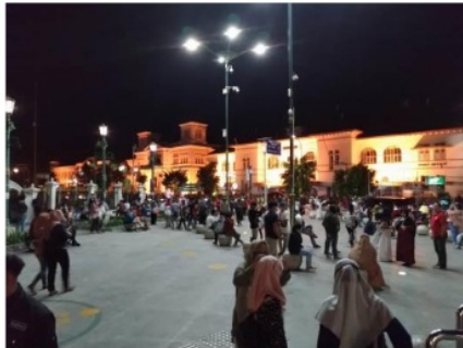
Figure 11. The neglected call for distancing.