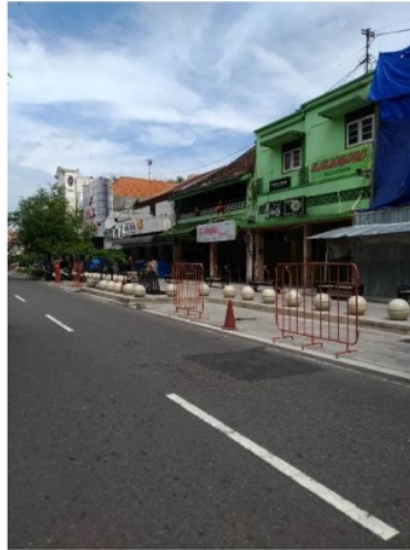
Figure 4. The parking area for pedicabs / horse carts and street vendors with low activity.

This condition is the impact of the social distancing policy issued by the Government to prevent the spread of the Covid-19 virus. With the appeal to stay at home, automatically activities in public spaces will also stop. Of the 153 respondents, 98.7% have known social distancing and the benefits of social distancing (98.7%). According to the poll conducted, 60.1% (92 people) of respondents agreed that social distancing reduces their comfort in interacting with others, while 27.5% (42 people) of respondents did not feel social distancing policies reduce their comfort in social interaction. However, 93.5% (143 people) agreed to do social distancing in public spaces, meaning that respondents had the awareness to maintain social distancing when in public spaces.