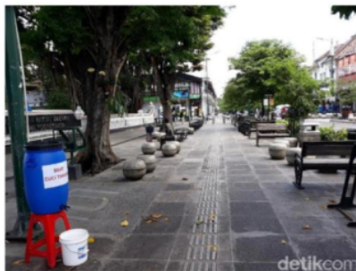
Foto: Malioboro sepi gegara pandemi Corona, Yogyakarta, Kamis (26/03/2020).

Figure 1. The quiet Malioboro area due to the corona virus pandemic.