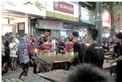
Figure 2. Night music attractions are one of the interesting activities in the Malioboro street area.

As a public space, Malioboro is inseparable from the architectural elements that form it, such as old buildings that are still standing and street furniture along Malioboro. This is evidenced by the