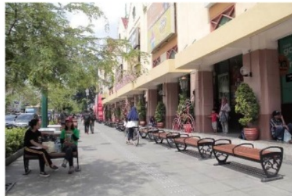
Figure 3. Street furniture in Malioboro.

The existence of Malioboro as a public space is in accordance with Illiyin and Idajati (2015) opinion, where this area is able to accommodate various community activities both individually and in groups, and is able to become a place for people to socialize, seek entertainment, and release fatigue with socio-cultural distinctiveness (Manurung, 2018) in Malioboro.