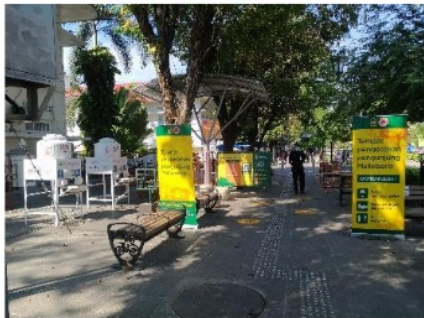
Figure 7. An appeal in the form of writing or graphics placed on the pedestrian path.