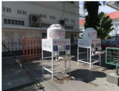
Figure 5. Hand washing facilities provided by the government.

In addition to providing handwashing facilities, another method used to monitor people who are active in this area is by dividing the Malioboro area into 5 zones. The first zone starts from the Inna Malioboro hotel to Malioboro Mall. The second zone is from Malioboro Mall to Mutiara Hotel, the third zone from Transjogja 2 - Suryatmajan Bus Stop, zone four from Suryatmajan - Pabringan,