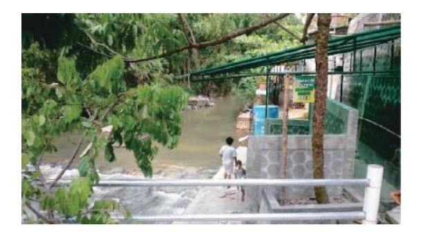
Figure 2 illustrated that the bathing area for kids near the riverbanks. Since the position in Winongo River may have strong stream during rainy seasons, the safety issue should be taken into account. The bounder of the river was not available so this area has danger potential for children.

Figure 2. Bathing area without bounder