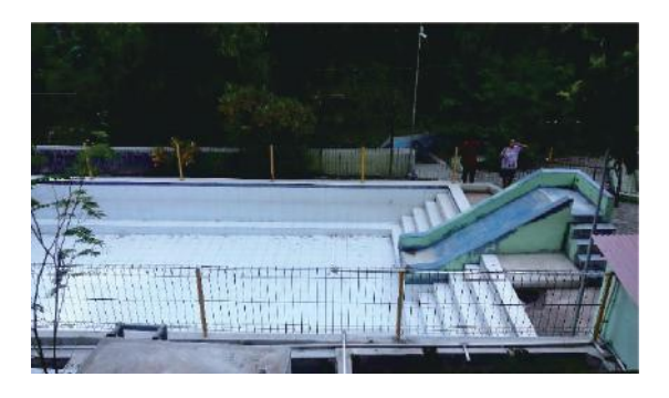
Figure 7. Slides in the swimming pool started to decay and it may potentially causes jammed in

Safety and Comfortableness of Playing as the Manifestation of Child Friendly Kampung. Case Study of Kampung Badran Yogyakarta Hastuti Saptorini and Heri Apricilianingtyas 39