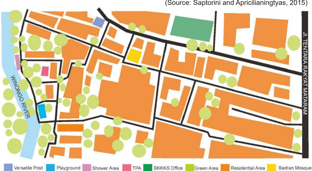
Figure 1. Location and access to the playing area