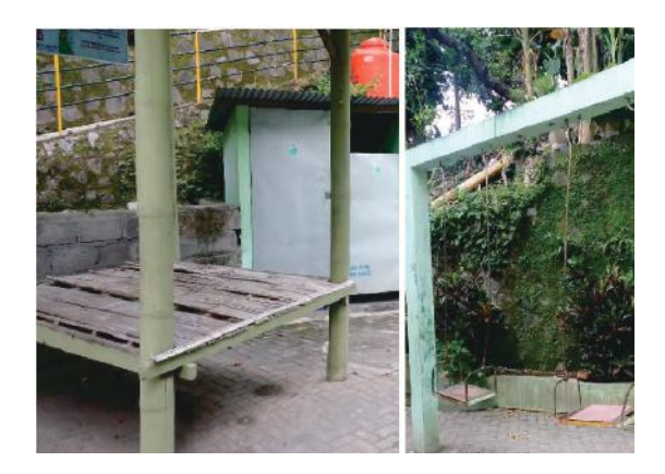
Figure 6. Swing with Iron material and wood that started to decay may cause danger to the children (Source: Saptorini, 2015).

The available facilities or equipment for playing are quite various such as swing, slides, swimming pool, etc. that have become the favorite among the children. The swing (Figure 6) is made of frame with iron material and wooden seat. However, the metal that supposed to move in dynamic style is yet rot and corrosive. The seat is also decayed that may potentially cause accident. This also happened to the slides in the swimming pool (figure 7). The seat started to decay because of exposure to sun and rain that make it not safe for children. The slides also do not have railing so it is a bit dangerous for children to slide in group.