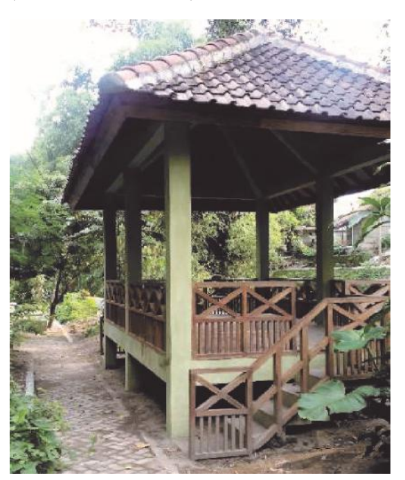
Figure 5. Stage gazebo with height of 0.6 meter