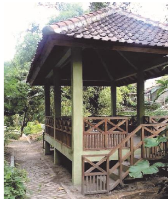
Figure 5. Stage gazebo with height of 0.6 meter