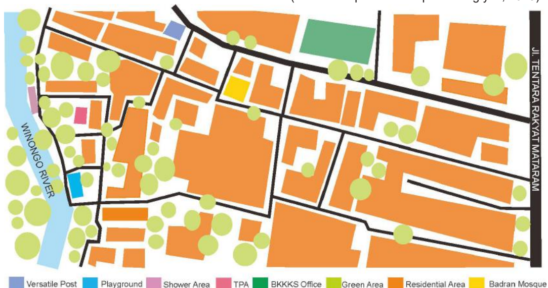
Figure 1. Location and access to the playing area