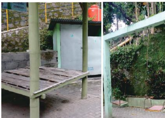
Figure 6. Swing with Iron material and wood that started to decay may cause danger to the children.

The available facilities or equipment for playing are quite various such as swing, slides, swimming pool, etc. that have become the favorite among the children. The swing (Figure 6) is made of frame with iron material and wooden seat. However, the metal that supposed to move in dynamic style is yet rot and corrosive. The seat is also decayed that may potentially cause accident. This also happened to the slides in the swimming pool (figure 7). The seat started to decay because of exposure to sun and rain that make it not safe for children. The slides also do not have railing so it is a bit dangerous for children to slide in group.