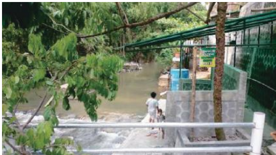
Figure 2. Bathing area without boulder

Figure 2 illustrated that the bathing area for kids near the riverbanks. Since the position in Winongo River may have strong stream during rainy seasons, the safety issue should be taken into account. The boulder of the river was not available so this area has danger potential for children.