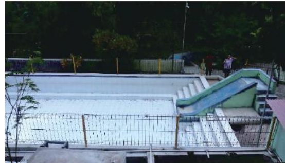
Figure 7. Slides in the swimming pool started to decay and it may potentially causes jammed in

The available facilities or equipment for playing are quite various such as swing, slides, swimming pool, etc. that have become the favorite among the children. The swing (Figure 6) is made of frame with iron material and wooden seat. However, the metal that supposed to move in dynamic style is yet rot and corrosive. The seat is also decayed that may potentially cause accident. This also happened to the slides in the swimming pool (figure 7). The seat started to decay because of exposure to sun and rain that make it not safe for children. The slides also do not have railing so it is a bit dangerous for children to slide in group.