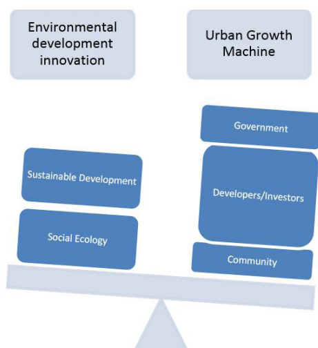
Chart 2. Contestation of Changes in Land Use and Land Tenure in Development in Surabaya

The chart above illustrates a coalition between political elites and economic elites who work together to create a consensus on urban growth. For the Surabaya City Government, the coalition is important, because the City Government are obliged to build cities together with communities