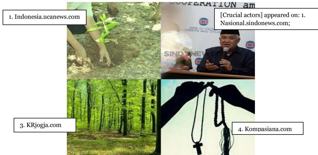
Figure 2. Visual images in a few news with the keyword “Berita Agama dan Lingkungan”