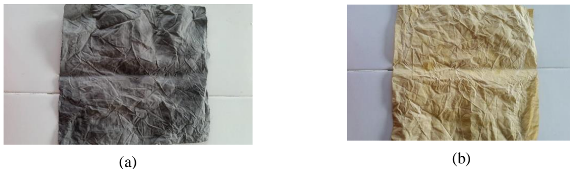
Figure 2. Photograph of dyed fabrics with: (a) ferrous sulphate; (b) alum